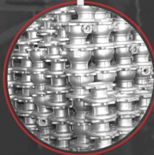
04/ Semi-finished casting