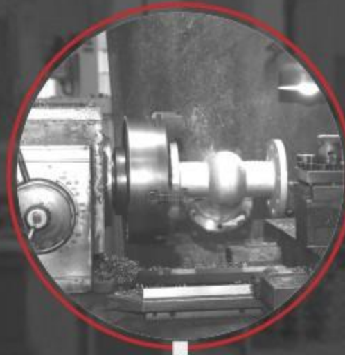
05/ Semi-finished processing