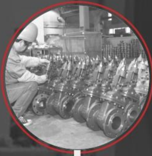
11/ The paint