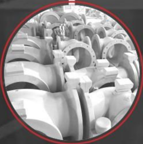
02/ Moulding process