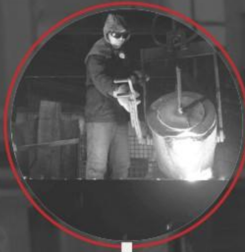
03/ Casting process